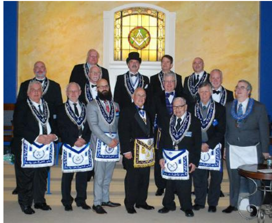
OFFICERS OF TEMPLE LODGE #65

I find myself writing this note in front of a warming fire on a cold and snowy MLK weekend in Vermont. While far from Temple 65 in Westport, my thoughts could not be closer.