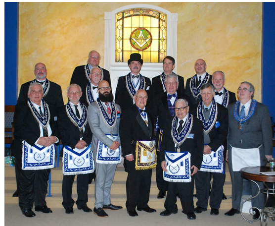
OFFICERS OF TEMPLE LODGE #65

February is one of my favorite months for many reasons, this year it has particular importance.